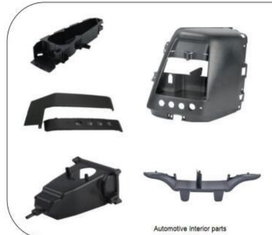
Automotive interior parts