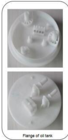
Flange of oil tank